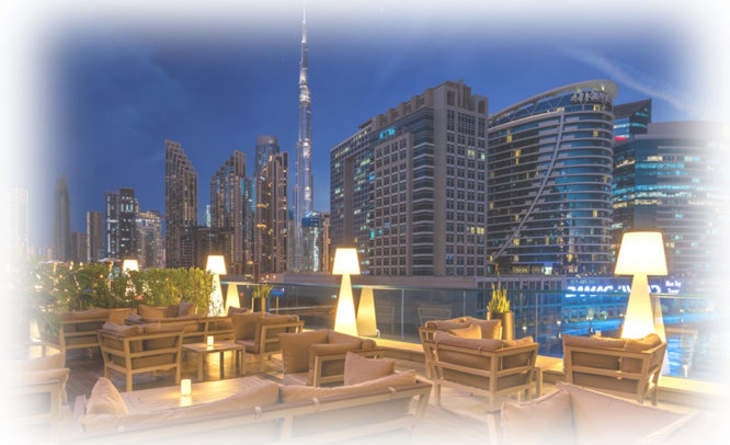
Radisson Blu Waterfront

So, let's take this excursion to Dubai in September!