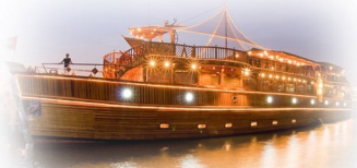
world's largest 'dhow', a traditional Arabian boat

Dashing Dubai Trip information will be provided in each newsletter. It is extremely important to Fantom Travel Group that each of you enjoy every minute spent in Dubai!